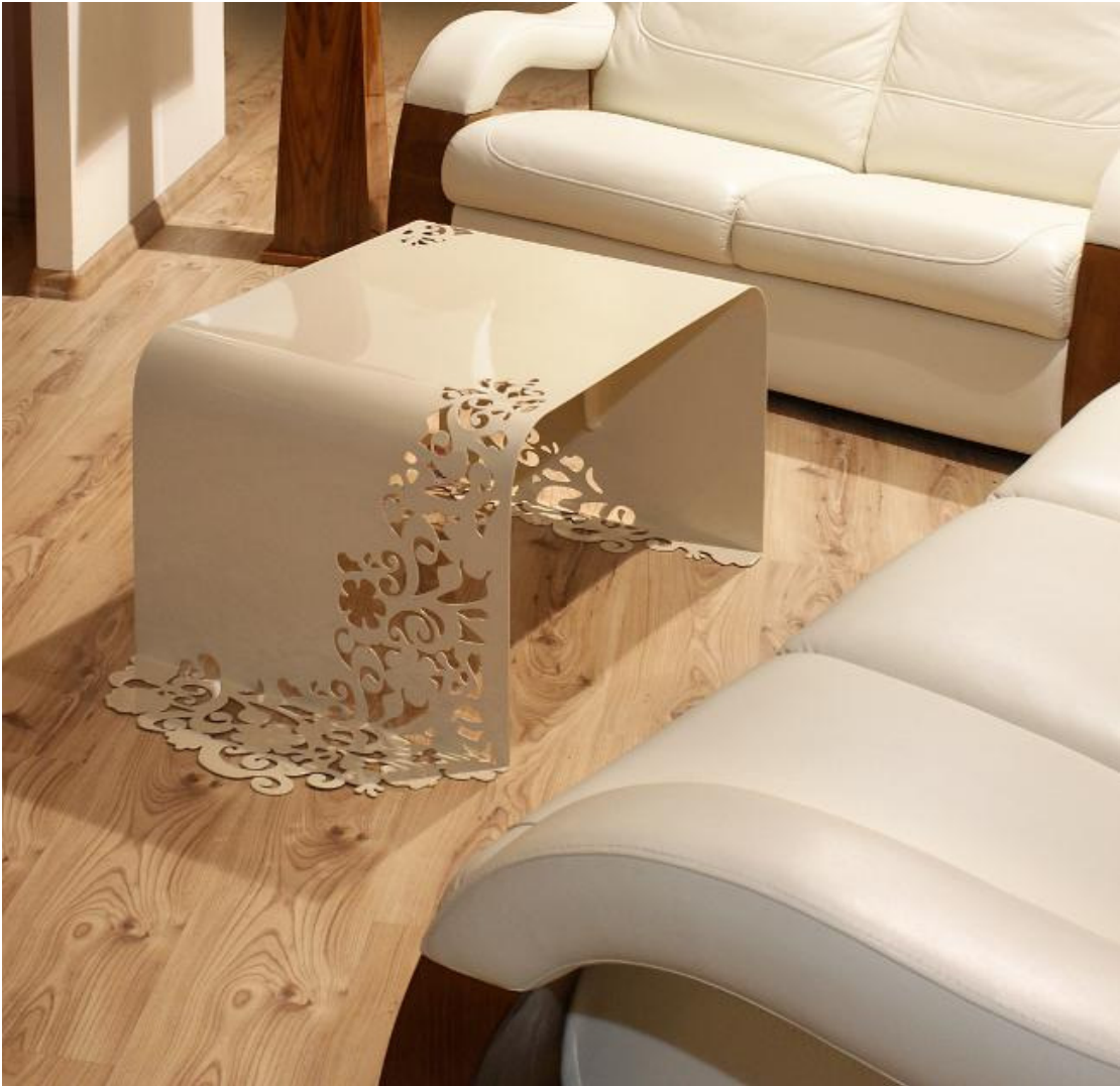
4) Ikebana coffee table, Laskowscy Design